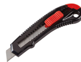
CT216... Super Snap-Off Knife